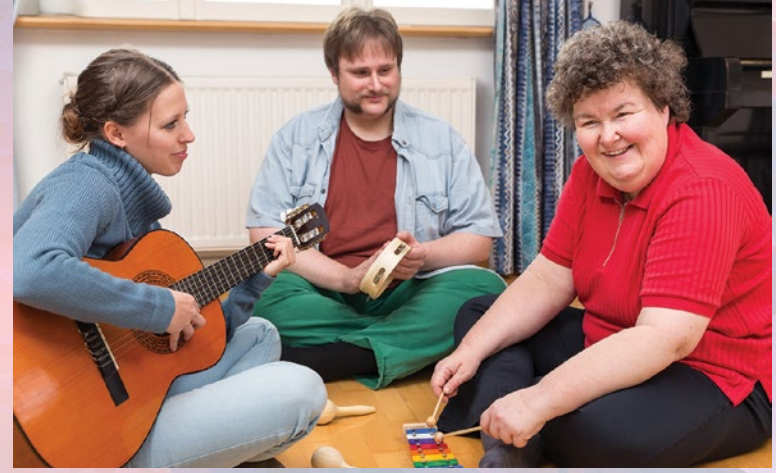
Sources: musictherapyontario.com, themusictherapycenter.com, musictherapy.org

Currently, there are about 6,000 certified music therapists in North America who help patients on a regular basis.